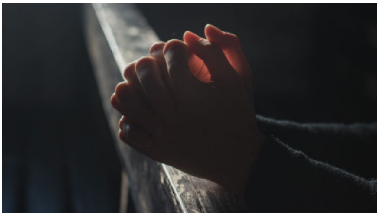
Table Time Discussion

Read Phil 3:7-12 aloud. In different versions. Discuss it.